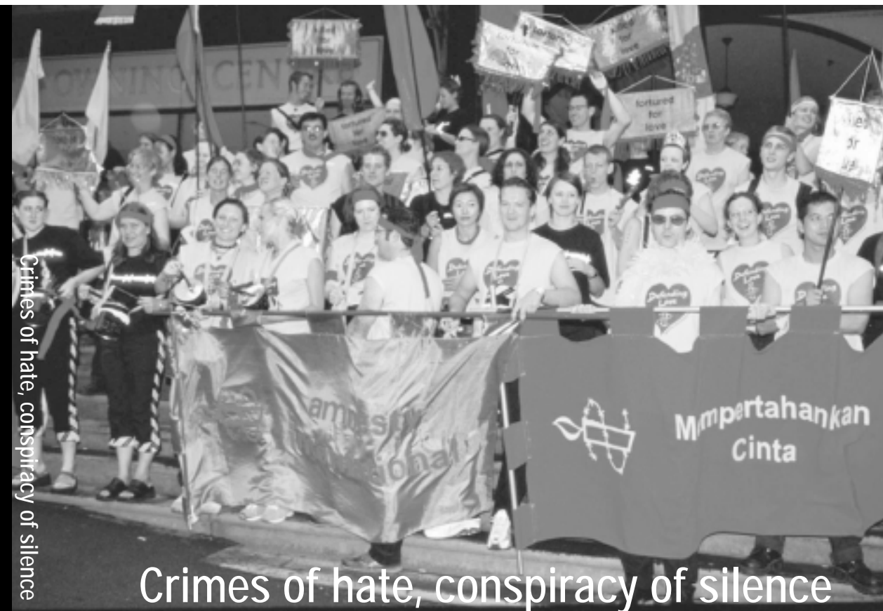
Crimes of hate, conspiracy of silence

This report, released as part of Amnesty International's worldwide campaign against torture, is a contribution to these growing international efforts to end violence against lesbians, gay men, and bisexual and transgender people.